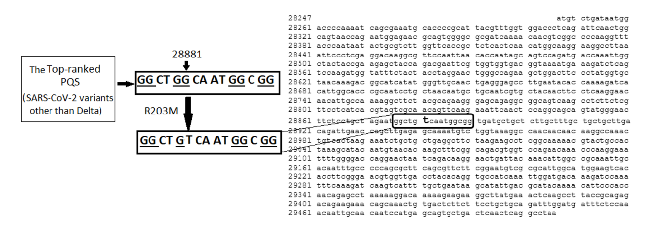
Fig. 2. R203M takes place in position 203 of the N protein in the Delta variant, which is nucleotide 288881 of the virus genome. It exactly overlaps with the formation of the top-ranked PQS. Guanine-rich sequences with four guanine repeats tend to fold intramolecularly into DNA quadruplexes. This guanine at 28881, plays an important role in the formation of the PQS, and the conversion of G to T reduces the possibility of the formation of a G-quadruplex structure.