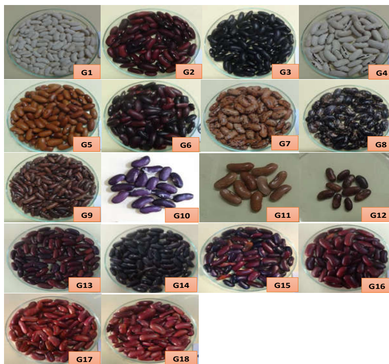
Fig. 1. Variation in seed color, shape, and size in kidney bean germplasm.

Research Institute). Unlike these genotypes, the Sylhet local germplasm G8 which was black in color with light brown spot and produced comparatively lower yield (1.97 t/ha). The germplasms collected from Bandarban e.g. G13, G14, G15, G16, G17 and G18 were brown to deep brown in seed color. Interestingly, these genotypes were found lean and weak at the vegetative growth stage, hence produced low yield (0.80 -1.87 t/ha). The bean seed colors of advanced lines collected from BARI were purple (G10), very light brown (G11) and brown spotted red (G12). The recorded yield of advanced lines was 1.75 t/ha in G10, 1.80 t/ha in G12 and 2.00 t/ha in G11. The released variety of kidney bean G1 (BARI Jharsheem- 1) was white-colored small-sized seed exhibited yield 1.47 t/ha (Table 2). Seeds of G2 (BARI Jharsheem-3) were robust and cultivated generally for dry seed consumption. While G9 (BARI Jharsheem-2) was characterized as late variety (89 days) (Table 2) and was generally cultivated for fresh green beans for its slender pods.