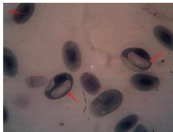
Fig. 1. Hepatozoon sp. in blood cells of Zamenis longissimus

Basis on the morphological characters of gametocytes, Hepatozoon sp. was observed in the RBC of two specimens of Z. longissimus (Fig. 1). The Measures were; LW 13.90\pm 0.58 \times 5.56\pm 0.33 ( 12.85\text{--}15.10 \times 4.86\text{--}6.02 \mu\text{m} ), LW 62.45\text{--}90.2 \mu\text{m} , L/W 2.64–2.50 (n=25). The mean intensity of Hepatozoon sp. in infected snakes was 1.8 per 10^4 RBCs. The examination of blood cells in Natrix species showed the presence of rickettsial infection (Fig. 2).